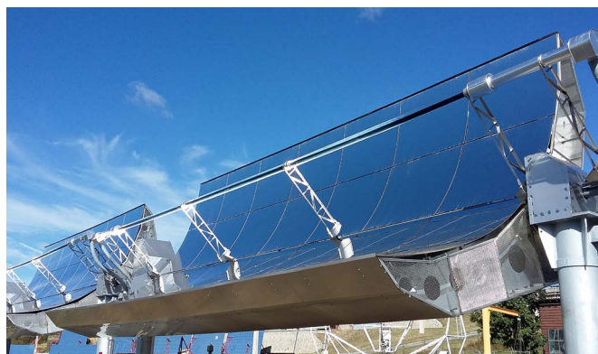
Concentrating solar technology - PROMES CNRS